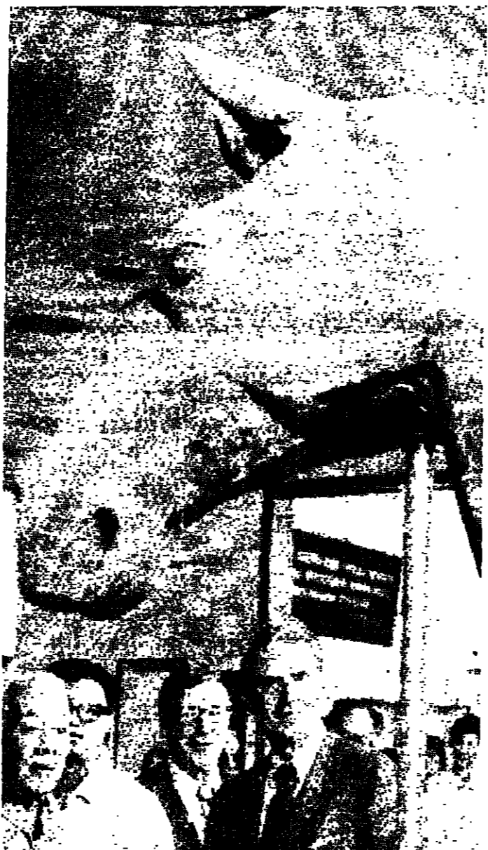
TIME OUT -- U.S. Secretary of State Cyrus Vance (right) takes time out from talks with Chinese officials to visit the Museum of History in Peking, Tuesday, where he saw a clay horse dated 290 B.C.